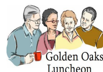
Golden Oaks Luncheon

Oak Grove Preschool & Kindergarten has PreK Openings. Call today for a tour #410-2251.